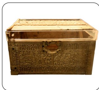
The Franks casket